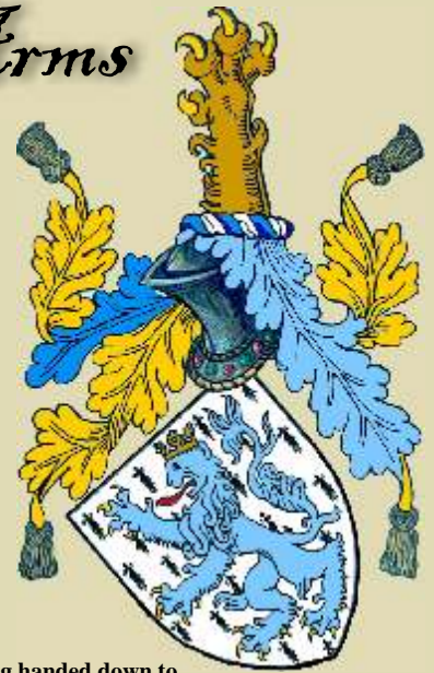
Peter Pickering handed down to Alfhard Kowallek, Germany Features: Lion facing left with crown, ermine background

Even though there are slight differences in the shields, the unifying image is of the “lions gamb erect erased ducal crown” of the crest.