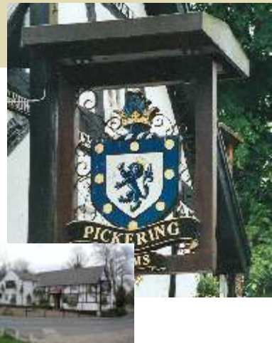
Pickering Arms, Thelwell, Cheshire Features: Lion facing front with crown, plain background, eight “plates” surround