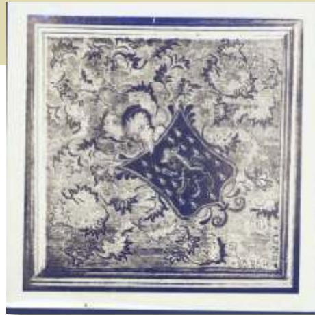
Tapestry by Sarah Pickering (unknown) , 1753 Features: Lion facing left with crown, ermine background