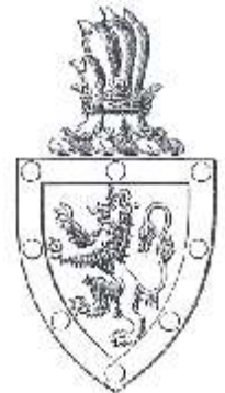
(Right) Coat of Arms for Robert Pickering of Walford Features: Lion facing left with crown, plain background eight plates surround