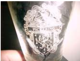
Etched crystal goblet inherited by Jason Friend ( we have not connected with our family yet. ) Features: Lion facing left with crown, ermine background